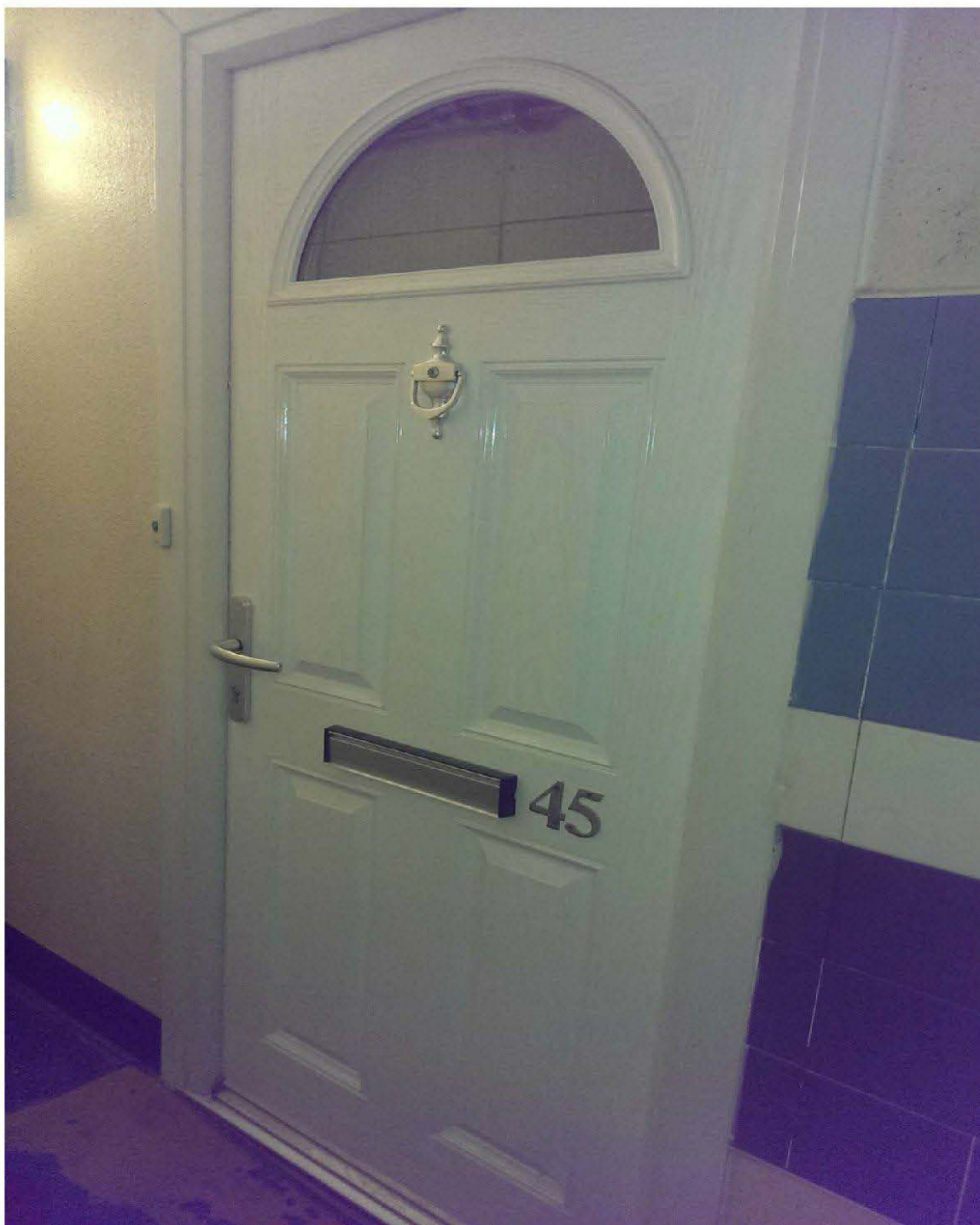
Flat Entrance door