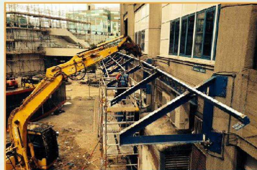
The canopy being removed

From next month the main temporary access to Grenfell will be from the walkway leading from Latimer Road or the stairs from Grenfell Road.