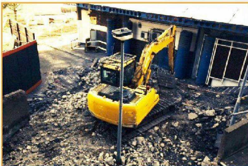
The ramp is demolished

The demolition of the ramp has now been done and the building's metal canopy around the block is being removed. We're sorry for the inconvenience which the ramp demolition has caused.