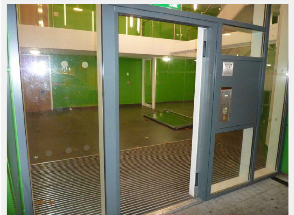
The entrance to Grenfell Tower with the broken door lying on the floor in the background!

local residents and our Councillors the entrance front door to Grenfell Tower is broken and remains permanently ajar so that anyone who chooses can gain access to our building. Nothing, to date, appears to have been done by the TMO to remedy this serious, unsettling and potentially dangerous situation.