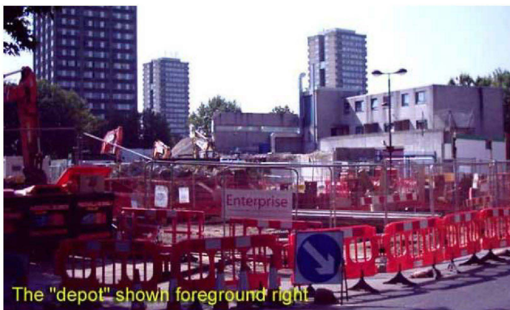
The "depot" shown foreground right

If anybody was wondering why there was a whole lot less noise than usual coming from the leisure centre site last week we found out why a few days ago. Leadbitters revealed in a recent email to us that they had suspended operations in the “demolition zone” because they had discovered asbestos on site. Because of this all the heavy machinery on the leisure centre site was parked up for a whole week. We wrote to Leadbitters, and one or two others, trying to get more detailed information, but without much success.