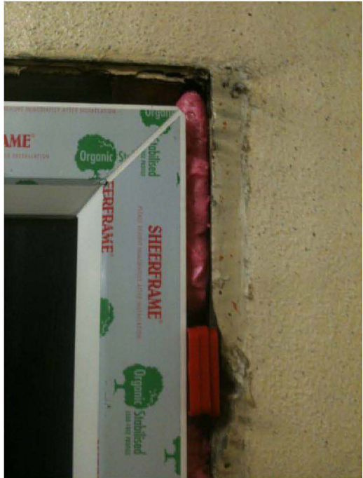
These images illustrate quality of installation, with packers applied next to the fixings.