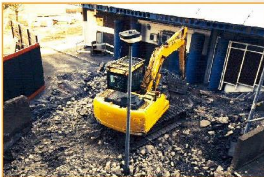
The ramp is demolished

The demolition of the ramp has now been done and the building's metal canopy around the block is being removed. We're sorry for the inconvenience which the ramp demolition has caused.