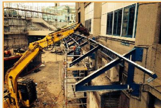
The canopy being removed

From next month the main temporary access to Grenfell will be from the walkway leading from Latimer Road or the stairs from Grenfell Road.