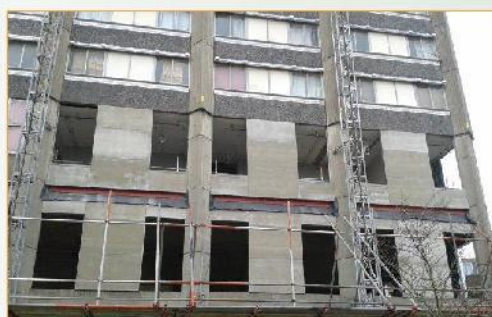
The outside of the new flats