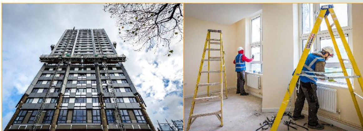
Work outside and inside nearing the final stages

Last but not least, we're working with the nursery and boxing club in preparation for their return to their new homes!