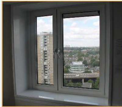
New double glazed window