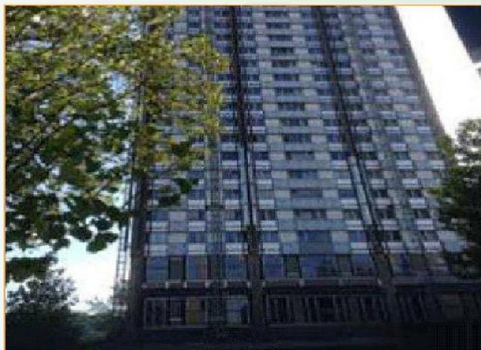
West side of the tower from below

You can now watch work in progress on www.kctmo.org.uk , click on Assets & Regeneration on the left hand side, then click on Grenfell Tower Regeneration.