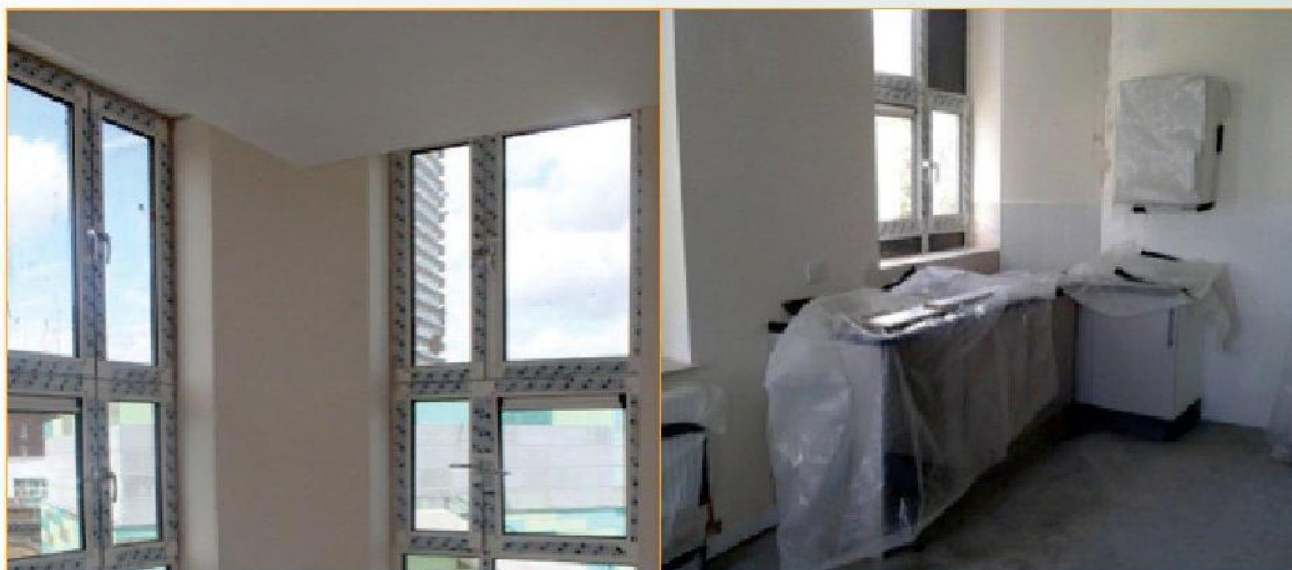
Sitting room and kitchen in one of the new third floor flats

We are happy to report that the nine new homes on the lower floors are nearly finished. These newly converted flats are part of the Council's Hidden Homes programme, in which new homes are developed from underused properties. The TMO will be managing these new social housing homes.