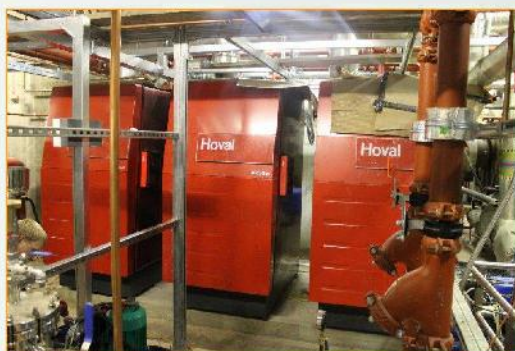
Newly commissioned communal boilers