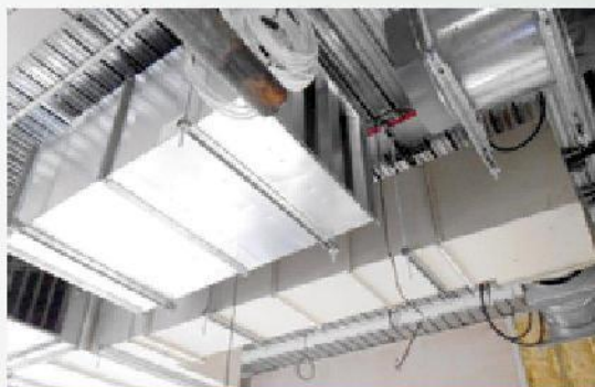
New heating and ventilation ducts in the foyer, before a false ceiling covers them