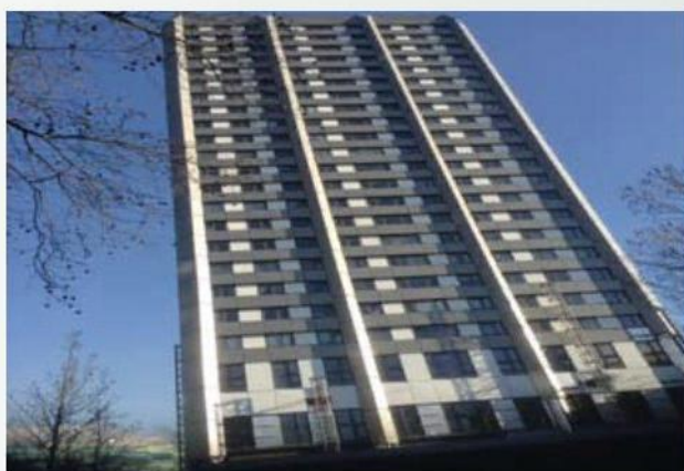
The mast climbers will all be gone soon, with cherry pickers completing the work

If you have a large item to dispose of please call RBKC's Streetline on [REDACTED]