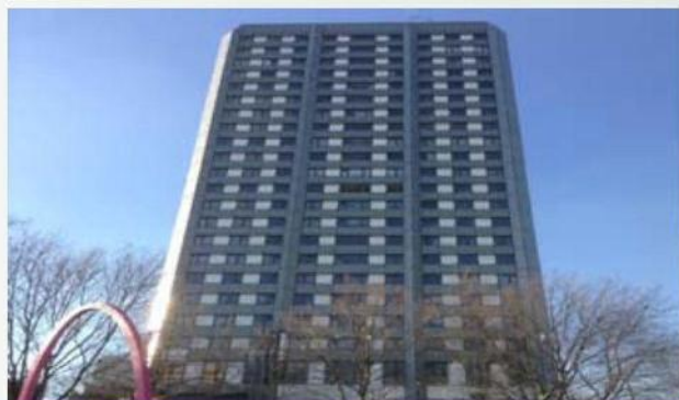
East elevation largely completed, apart from the lower three floors