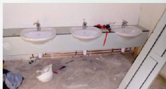
Fitting out of the nursery