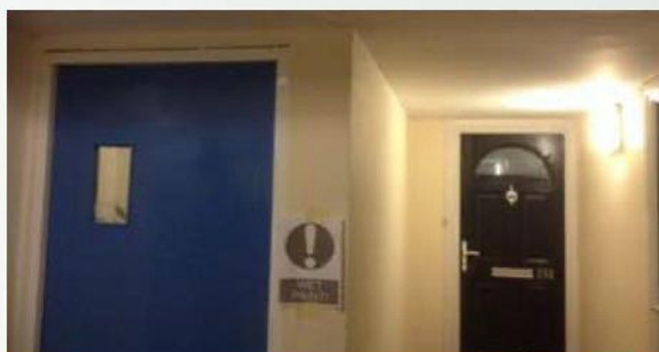
The redecoration of all 20 lift lobbies is underway