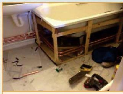
Heating and hot water pipes being installed