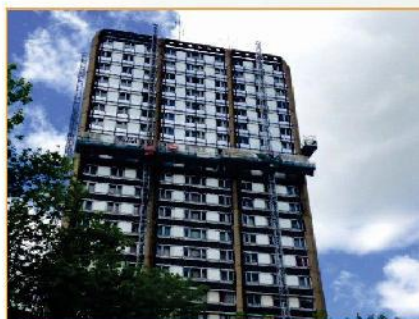
Windows and insulation being installed