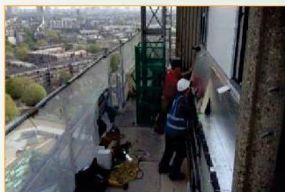
Cladding insulation panels being installed.