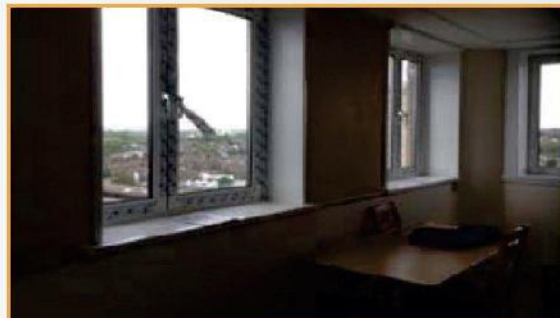
New windows in Flat 145

Drop-in session: a further session at Flat 145 will be on 11 June to show residents how the new windows look and the finished heating installation.