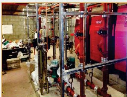
Boiler room upgrade is well underway