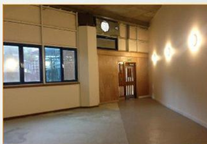
New walkway entrance with CCTV