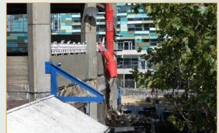
Chute from the old Social Services office