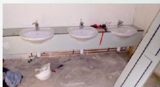
Fitting out of the nursery