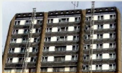
New window frames being fitted to the top five floors