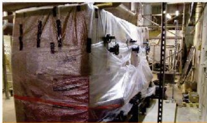
Three new boilers have been delivered to the basement