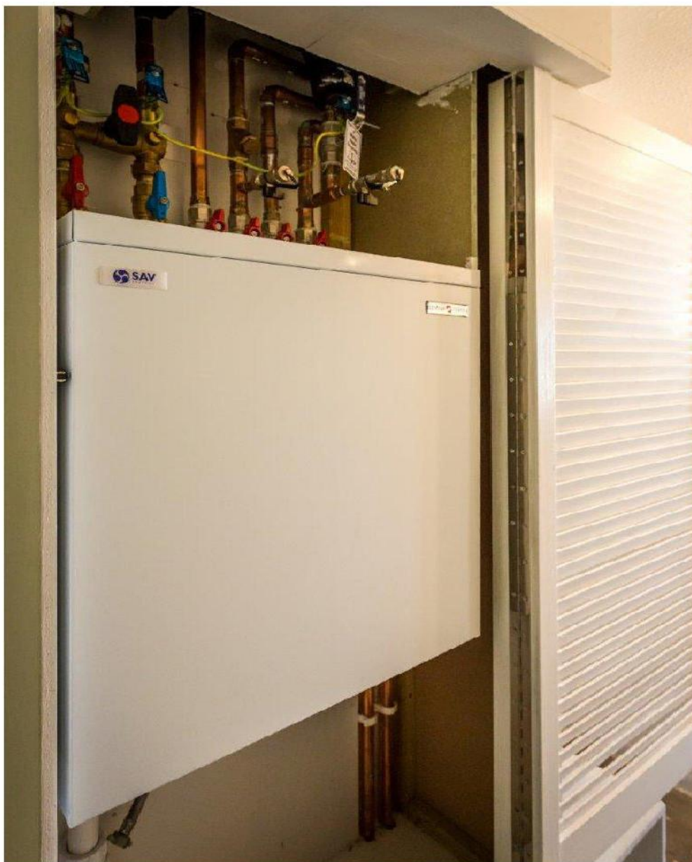
Heat interface unit (HIU)

The heating and hot water in your home is supplied by the communal boiler; this is brought into your home by the heat interface unit (HIU). This system provides you with complete control of your heating and hot water all year round.