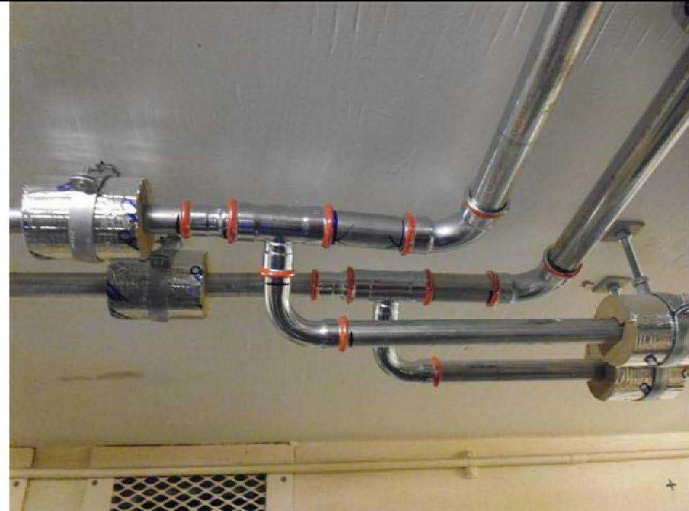
Joints are not leveled up correctly and are not crimped up but are marked up