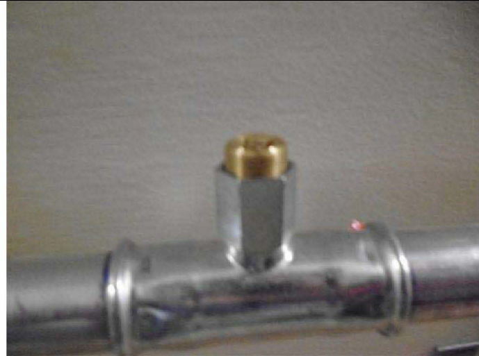
Manual air vent not made in