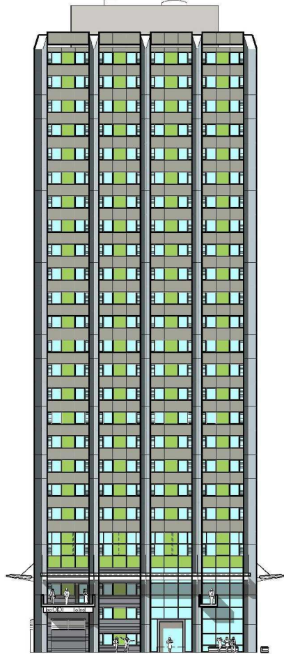
South Elevation 1:200