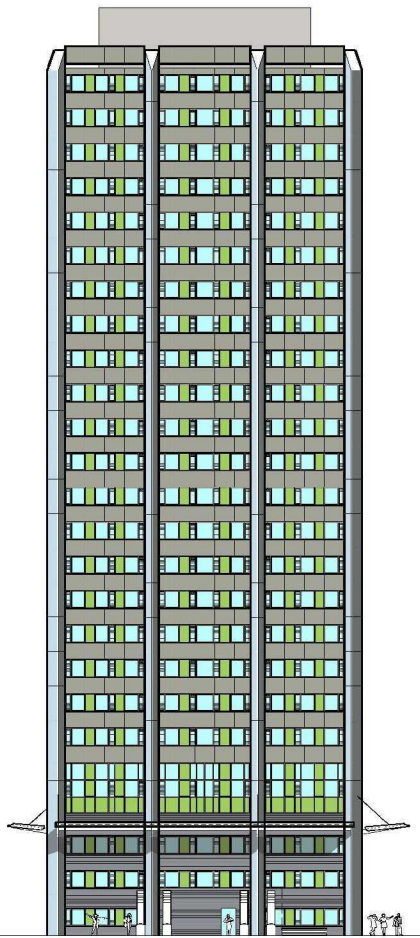
West Elevation 1:200