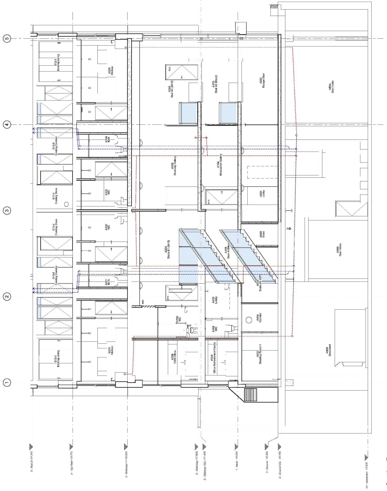
Section E 1: 50