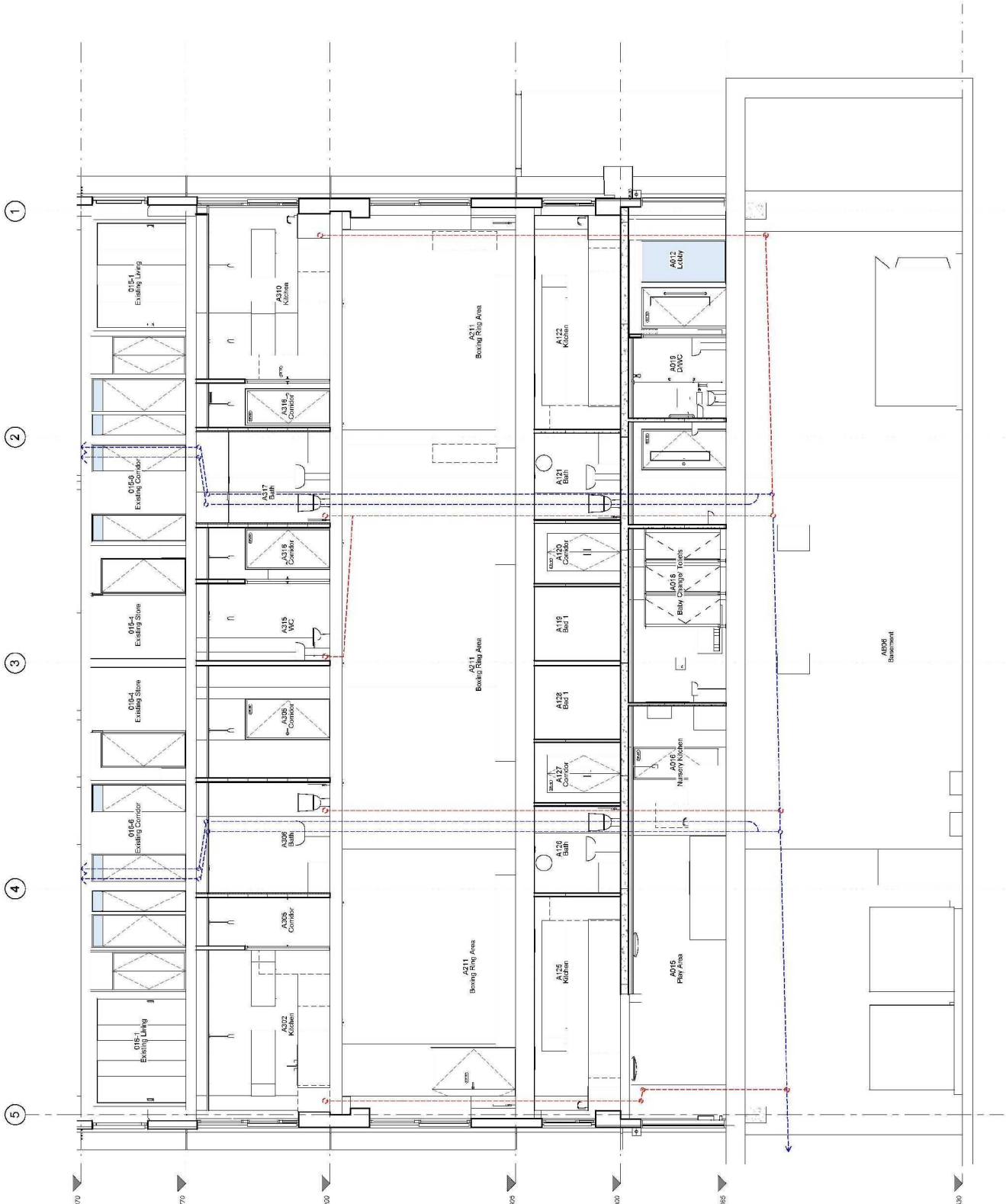
Section G 1 : 50

GREENFELLS TOWER REGENERATION PROJECT SECTION G DRAWN BY: [Redacted] CHECKED BY: [Redacted] DATE: 27/11/13 AS ISSUED 1:279 (05)105 00 DRAWN BY: [Redacted] CHECKED BY: [Redacted]