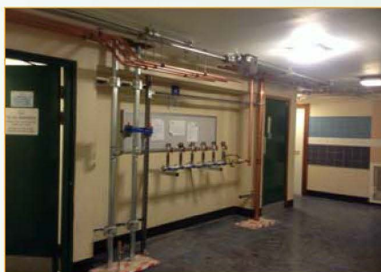
The new heating pipes

Lift lobby areas: the new vertical heating pipes have now been fitted. These pipes will be enclosed by a cupboard in the New Year. Work on the horizontal pipes which will connect the vertical pipes to flats is well underway.