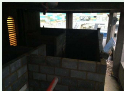
Changing room walls in the new boxing club