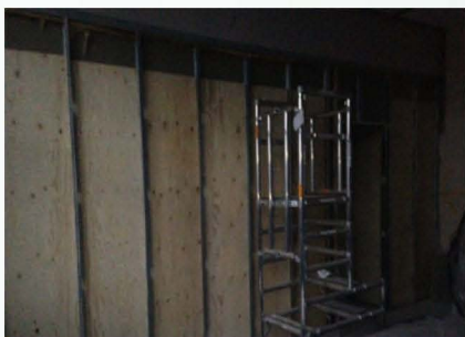
Partitions inside new flats on the lower ground floors

New flats and boxing club: internal walls are being created in the new flats and boxing club on the lower ground floors.