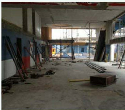
The mezzanine floor as it looks now

New flats and boxing club: installation of heating and electrical wiring in the new flats and boxing club will start in the New Year. Steelwork will be installed at the mezzanine floor in order to create a new lift lobby area. There will be four new flats on this floor.