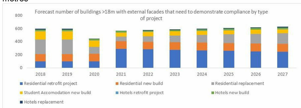
Figure B3: Estimate number of external cladding projects – residential and hotels over 18 metres

(Analysis by the Adroit Economics Consortium)