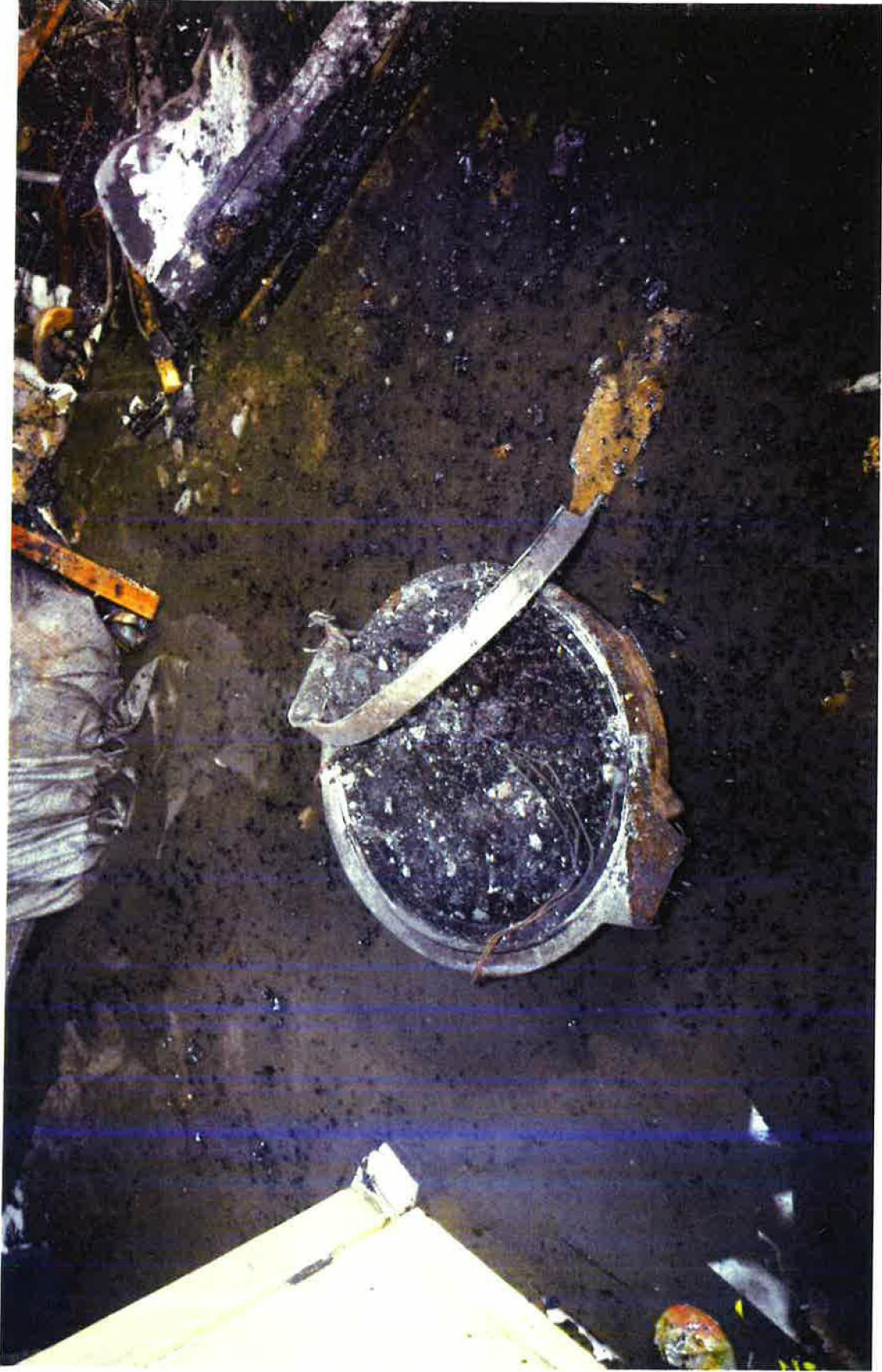
Photograph 46: BV report